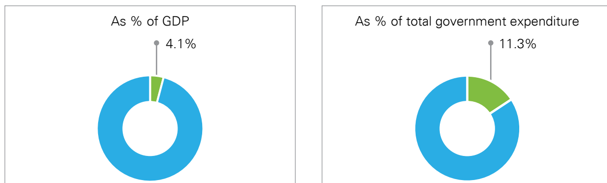
Figure 1. Government expenditure on education, 2016